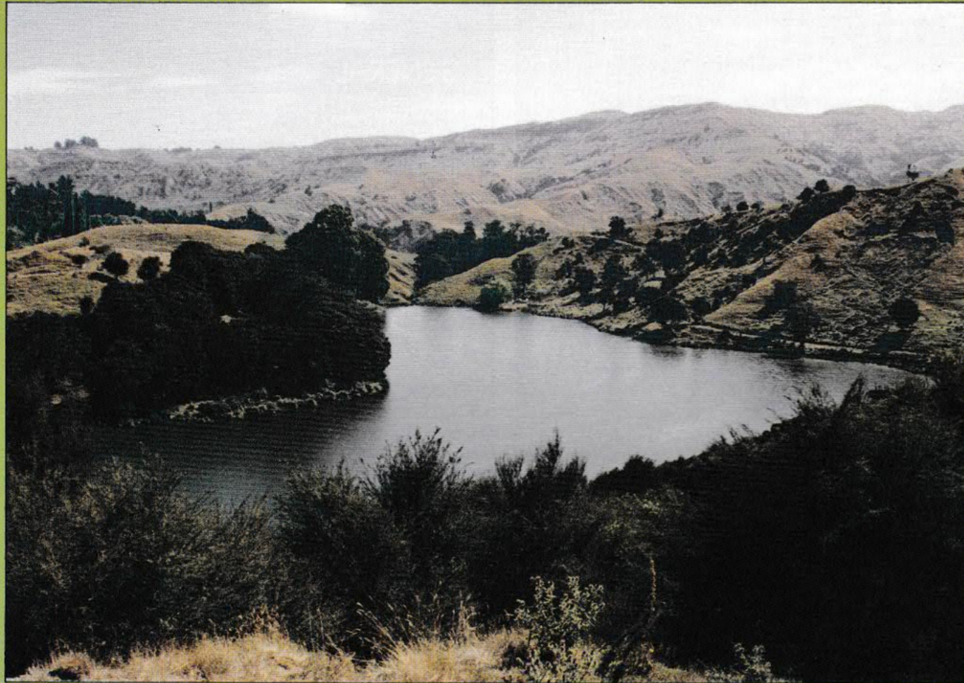
Lake Orakai, Hawkes Bay

is proud to support Ducks Unlimited (NZ) Inc. in their efforts to propagate and preserve New Zealand's rare waterfowl.