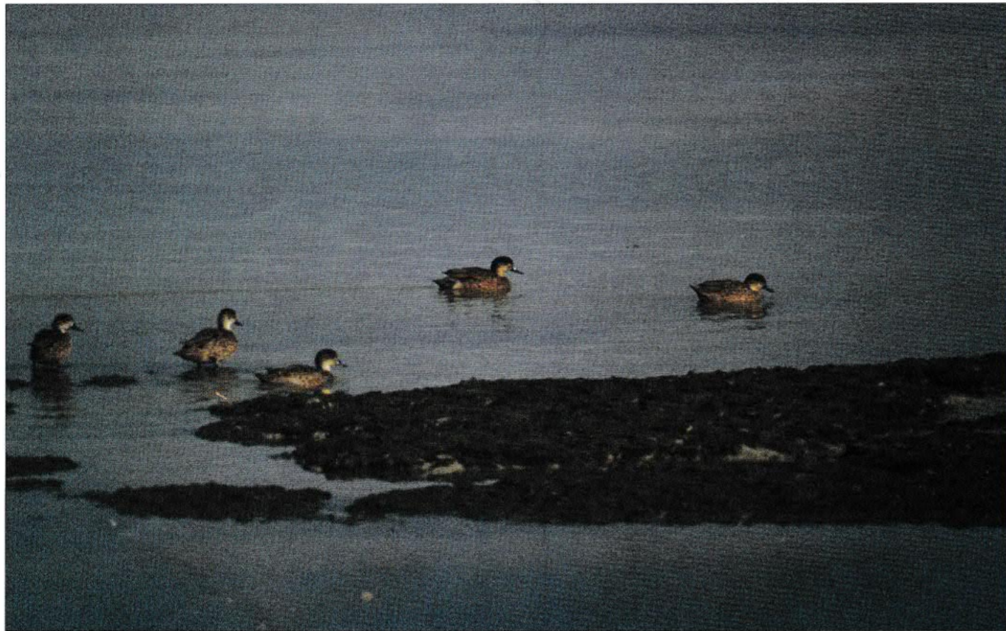
The Chestnut Teal is the top bird. All the rest are Grey Teal.

Chestnut Teal have now been observed at the Manawatu estuary during the duckshooting season for two consecutive years.