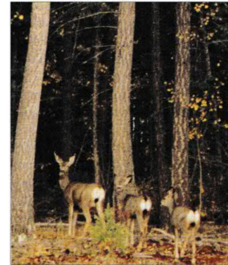
Mule deer are plentiful in B.C.

Soon everyone is seated at the tables which have carved wood signs at each one with names such as widgeon, scaup and mallard. The Master of Ceremonies gets everyone organised, talks about DU's history and helps draw the raffles. The food starts to arrive next and it is very good. Excellent homebaked bread with a salad and then the main course of stuffed gamehen followed by Black Forest gateau. The meal is served with the excellent red and white wines from British Columbia's fruit-bowl region the Okanagan. Some