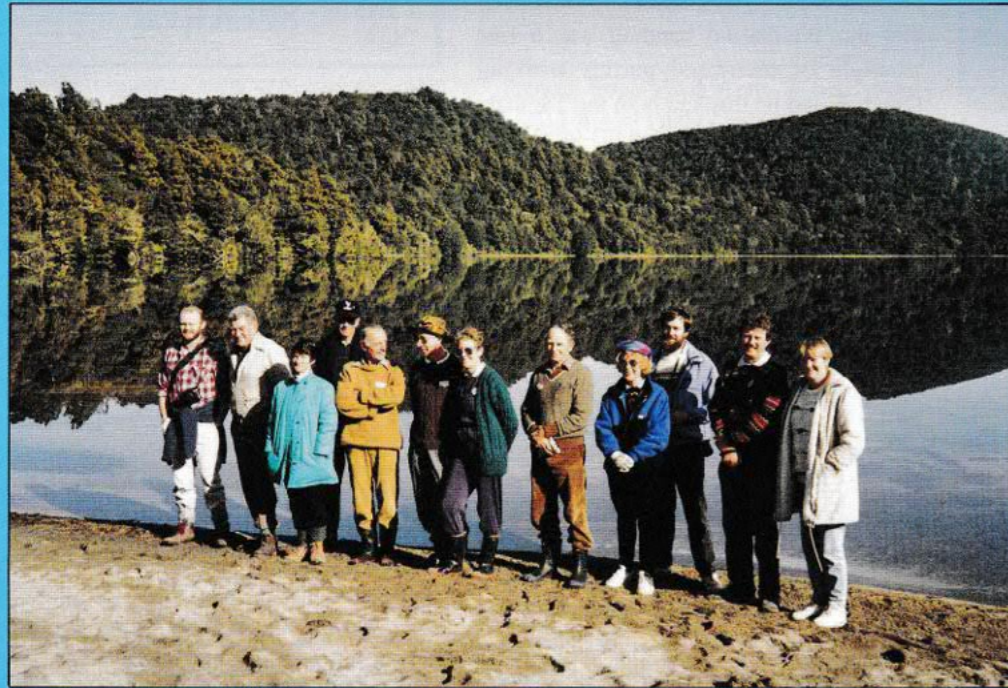
A group of keen walkers took in the beauty of Lake Rotopounamu on Saturday morning.