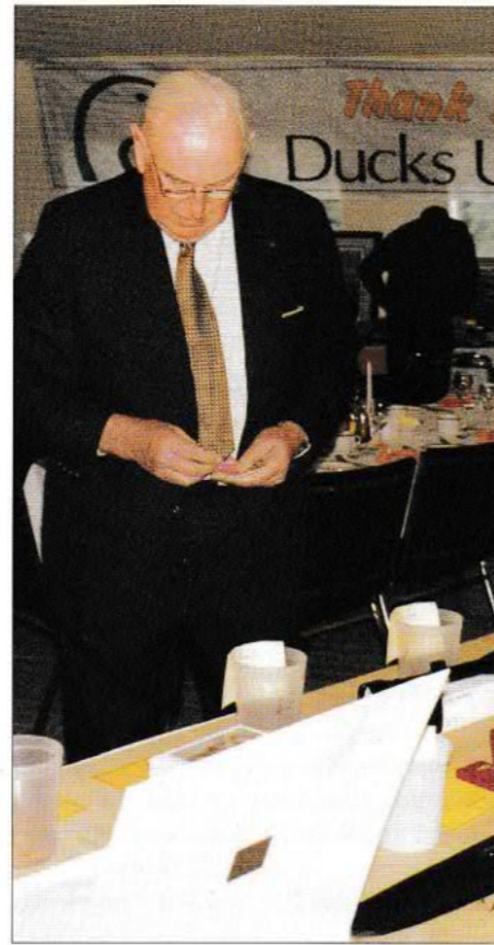
Raffle tickets are put in containers beside the item - a good system.

Drinks are purchased at the bar and snacks are served continuously as 125 people socialize and look at the auction items. The 100 Mile House Ducks Unlimited Dinner is famous throughout Canada for the amount of money raised from such a sparsely populated area, up to twenty thousand dollars in past years. Most people in the community give and only that day I had met Andreä Vaillancourt who runs a print and art shop in the town. Her contribution was to frame all the prints at the dinner which she has done magnificently. There were some dozen or so