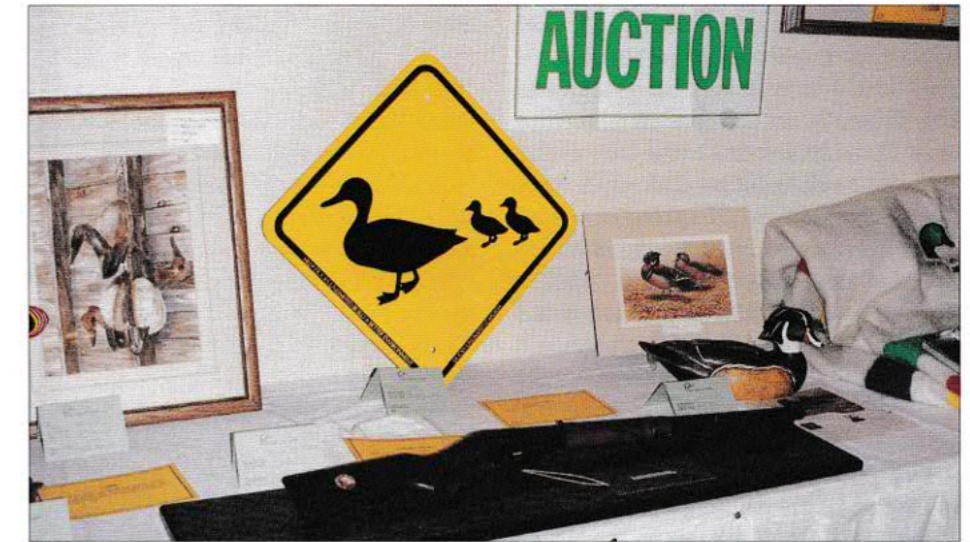
A selection of auction items.

I have come from Auckland to Los Angeles and then on to Seattle and Vancouver to stay with a friend in British Columbia. The first night is passed in long hours of sleep and I