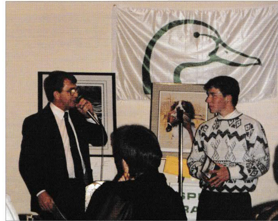
Doing it for the ducks.

silent auction items and forty main, or as the Canadians say, live auction items. As well they have door prizes and a special raffle for a shotgun. The majority of items are of DU origin with a greater variety than we are used to seeing in this country. All is set for a successful evening.