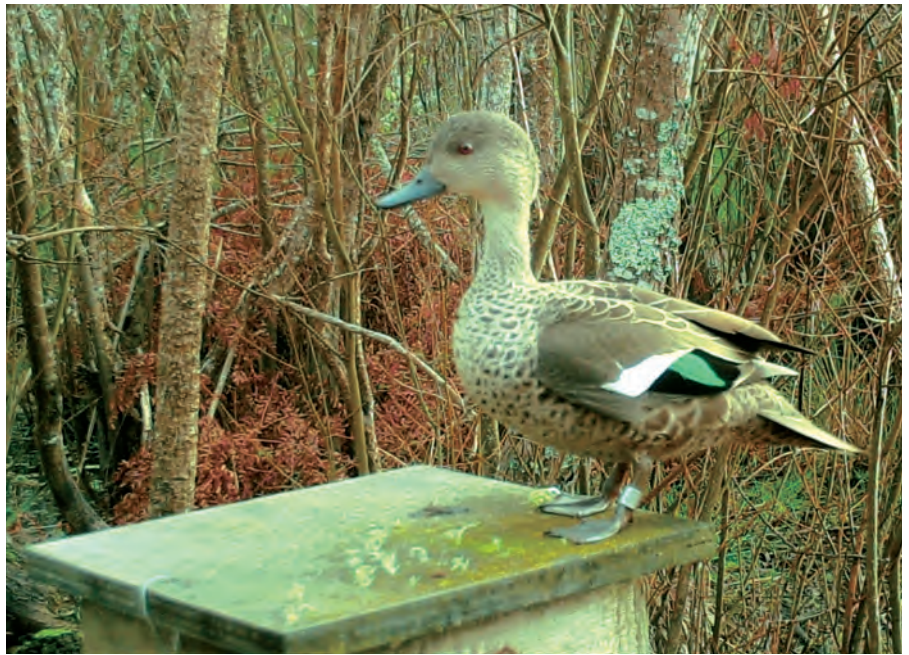
A banded grey teal on a nest box, and below, one of the older bands that has been flattened.

Grey teal females are somewhat easy to catch on their nest to apply bands to and they are not put off by such research. The bands show they will