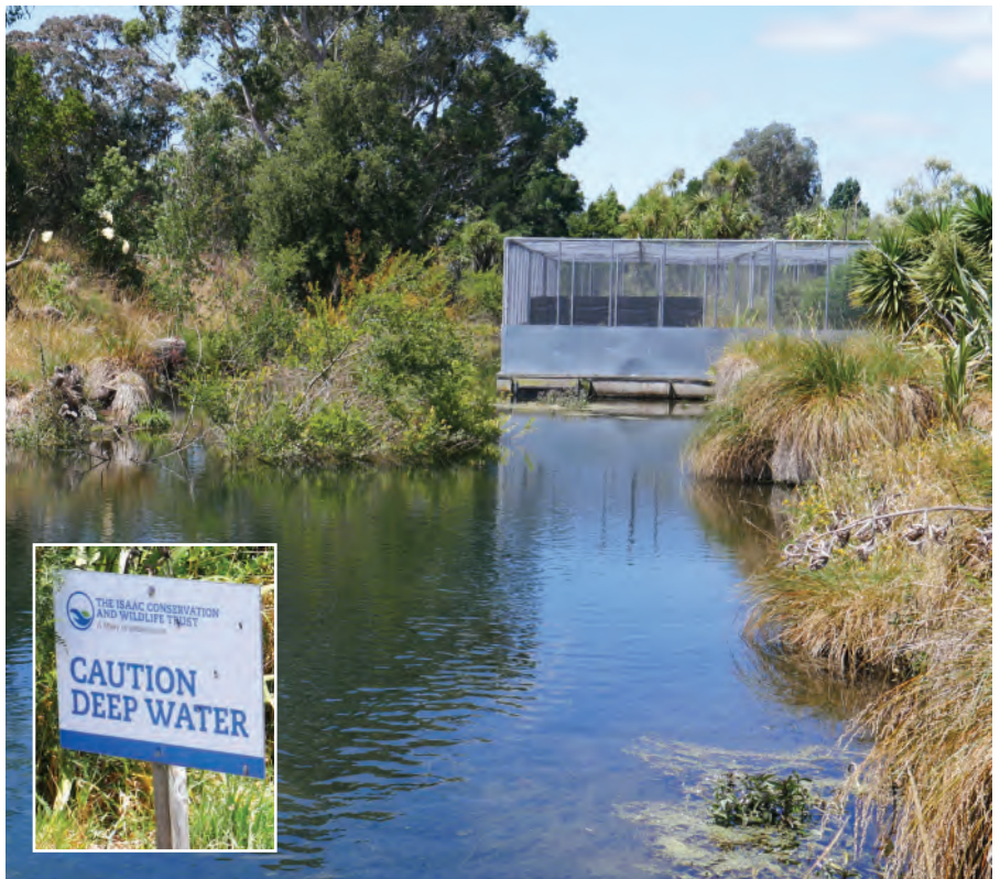
From top, paradise shelducks over Lake Woodley; one of the aviaries with water flowing through it, ideal for young whio to learn how to live in the wild; and a pond at Peacock Springs.