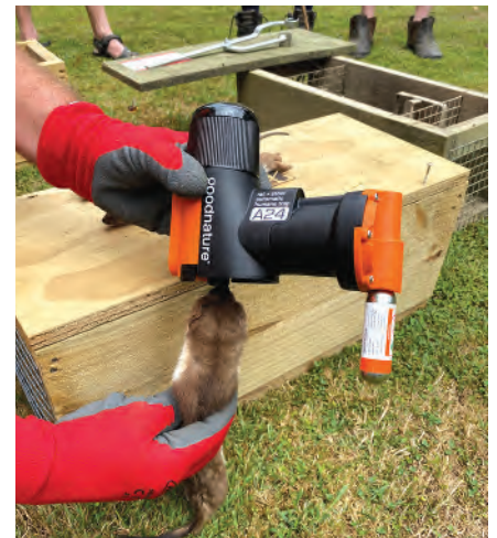
Left: Rounding up the usual suspects, a stoat, weasel and ship rat.