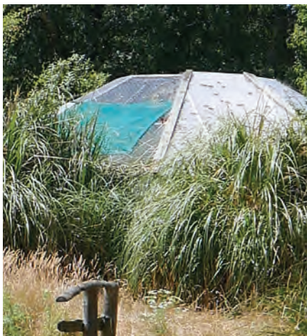
The aviaries are designed for breeding, not display. This aviary for orange-fronted kākāriki is not easily accessible and the birds are difficult to spot in the dense foliage.

release them in the south branch of the Hurunui in the Arthurs Pass region where intensive predator control is undertaken. At the time of writing there are thought to be 200 to 300 orange-fronted kakariki alive there, however this population could crash at any time.