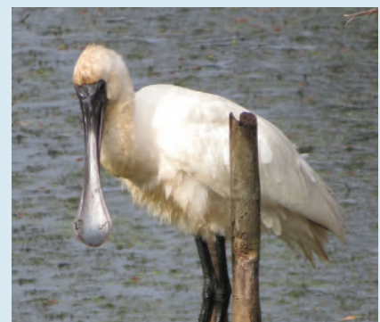
A spoonbill visits Lake Huritini, Levin.

■ Source: Szabo, M.J. 2013 [updated 2017]. Royal spoonbill. In Miskelly, C.M. (ed.) New Zealand Birds Online . www.nzbirdsonline.org.nz .