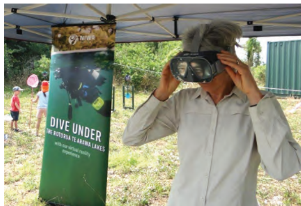
Left: The Te Awamutu Scouts, Cubs and Keas give a joint talk about native bats while Treelands install bat roost boxes during the Pūweto Festival at Lake Rotopiko. Above: The virtual reality lake dive at Rotopiko.

The importance of wetlands was celebrated on Sunday, 2 February 2020, with events around New Zealand for World Wetlands Day.