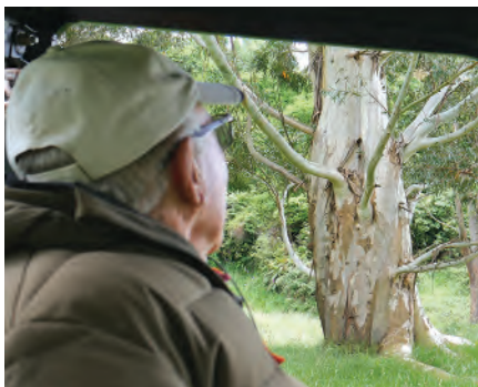
From previous page

The other birds that visit the farm also have plenty to feast on. There's dragon's gold kowhai and kaikamako for the tui and bellbirds, tree lucerne, or tagaste, for the wood pigeons and Himalayan strawberry trees, which all the birds love. He notes that the lucerne makes excellent firewood, "as good as maire", something that many people don't realise.