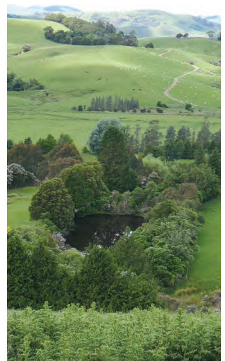
One of the ponds, the "Yellow Pine Wetland", nestled among the trees that Jim has planted.