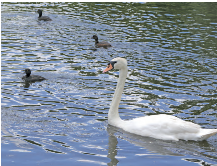
From top left: Many of the eucalypts – this one is probably Eucalyptus fraxinoides or Eucalyptus delegatensis – have bolted since 1990 when Jim planted them; seedlings (kānuka and mānuka, whau, blackwood and a Holm oak) waiting to be planted out; and one of the two mute swans and some scaup on the big pond.