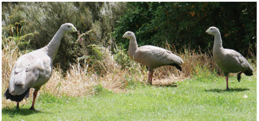
Cape Barren geese on the lawn outside the house waiting for treats.