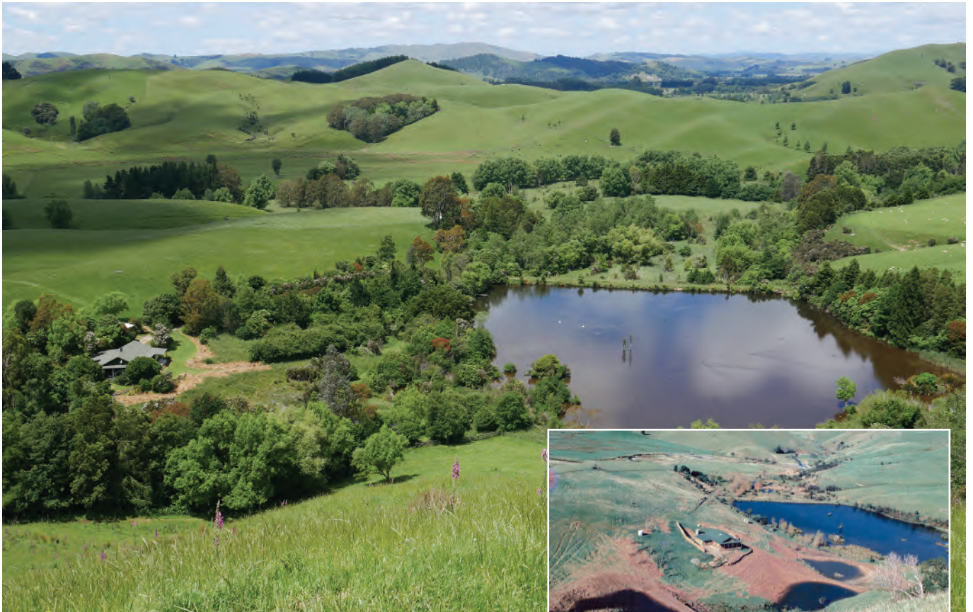
Jim’s house by the big pond, and right, an early photo from 1991 when the house was first built and extensive planting in the area had not yet begun.

Every tree on Jim Campbell’s family farm has a story to tell – and many of them he has nurtured from seedlings. Pockets of the 508-hectare farm resemble an arboretum, with precious specimen trees fenced and surrounded by other trees planted there to protect it from stock and the elements.