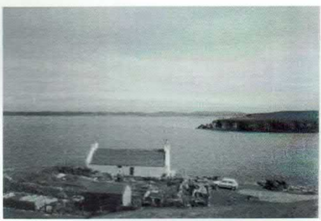
Norna's house, Shetland (see story in Flight 113, page 14)

- J Walcot (from Alex Gillett's Trout Cookbook, The Halcyon Press 2000.)