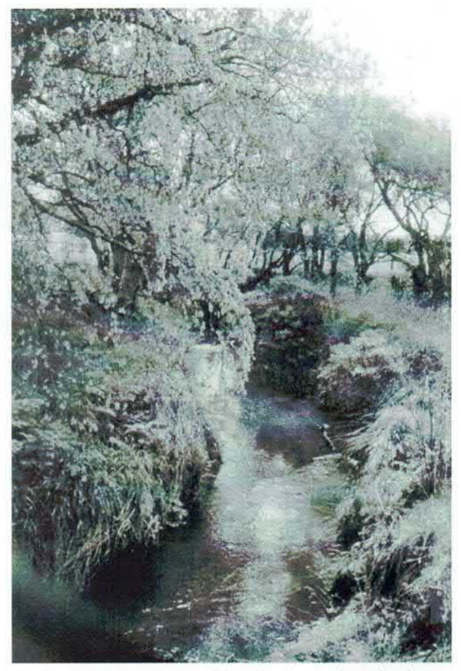
Kowhai Reach, Kauana, saved from being straightened in the 1960s.

It has been exciting to watch the growth of the kowhai trees and they seem to be healthy. The yellow flowers look spectacular and we hope they will be around for many years to come.