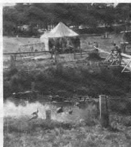
Further Game Fair Shots